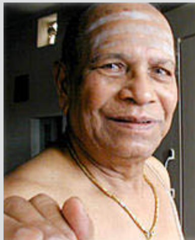
Sri Krishna Pattabhi Jois

One, we can accept right now, in this moment, that we are God.